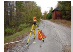
Robotic Total Station